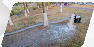
Well water lifting